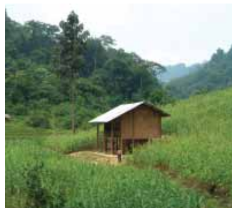
A ranger post in the buffer zone of the newly-established South Xuan Lac Species and Habitat Conservation Area.