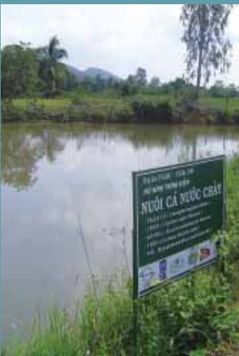
The fish pond model introduced in the buffer zone of Yok Don.

Promotion of off-farm alternative incomes through training for women's weaving groups.