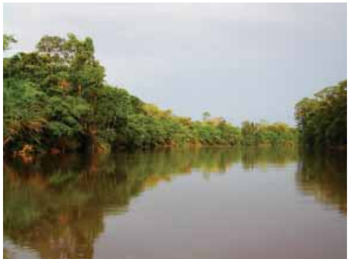
The Srepok River, Yok Don National Park