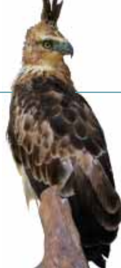
The Crested-serpent Eagle is a resident of all PARC Project sites.