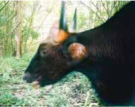
Gaur, caught by camera trap