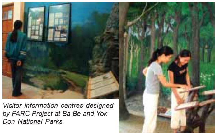
Visitor information centres designed by PARC Project at Ba Be and Yok Don National Parks.

At Ba Be, PARC has helped establish a local Boatmen's Association to encourage the self-organisation of local residents who earn income by providing boat tours to visitors.