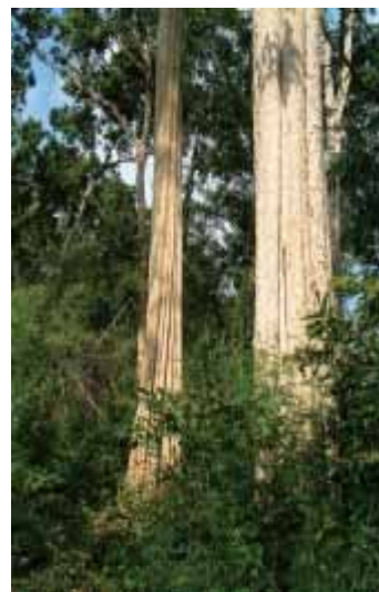
Lagerstroemia in the evergreen forest of Yok Don National Park

Village Forestry Clubs were established in Ba Be and Na Hang to provide interested households with a forum for exchange and discussion on common social forestry issues. The common goal of these clubs was the protection of watersheds, prevention of erosion, conservation of habitat and creation of future income sources.