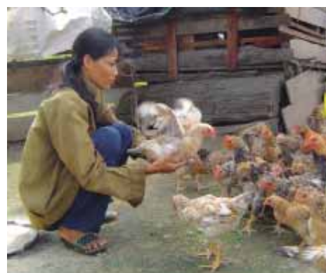
In the Yok Don area, the project supported local communities by identifying obstacles to successful chicken breeding.