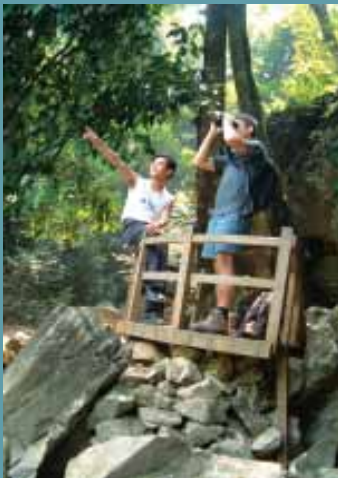
Guided tourism services in Ba Be National Park.

Tourist facilities and interpretation improved in Ba Be and Yok Don National Parks.