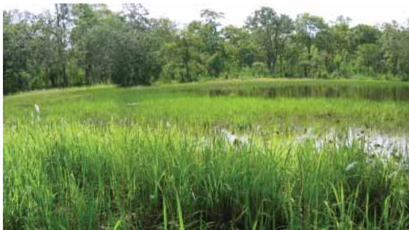
Mapping waterholes like this one in Yok Don National Park was important for defining