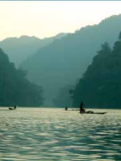
Local fishermen are stakeholders in biodiversity conservation through the Ba Be Lake Management Co-operative.

In Yok Don National Park, waterholes are key ecological units of the landscape, providing seasonal water supplies for many animal species. The project mapped the most significant waterholes, and combined this information with other conservation data to identify biodiversity hotspots to target conservation activities in the park. As with other prime biodiversity areas, conservation management of the assemblage of waterholes in the national park is carried out through site planning.