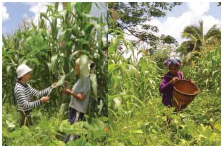
Intercropping maize and green beans.