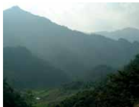
Looking into the South Xuan Lac Species and Habitat Conservation Area.

The proposed Francois' Langur "Tu Cang" Species and Habitat Conservation Area , supports the largest known population of Francois' Langurs in Viet Nam. Tu Cang is the name of the species in the local Tay language. These primates inhabit the relatively undisturbed limestone forests of the site, which also supports communities of rare conifers and broadleaf trees. Official site gazettelement is anticipated in early 2005.