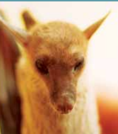
Cave Fruit Bat, Eonycteris spelaea , one of 17 species of bat recorded in Puong Cave, Ba Be National Park. The project identified the cave as a landscape feature requiring its own management plan.