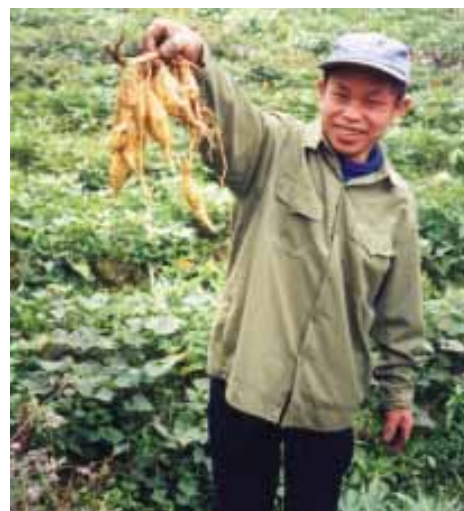
A farmer in Ba Be shows off his sweet potatoes.

All cattle vaccinated against foot and mouth disease.