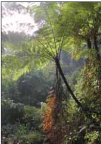
Forest at Na Hang

The main threats to biodiversity in the area come from habitat fragmentation, large-scale infrastructure development, illegal hunting, over-exploitation of non-timber forest products, and livestock grazing.