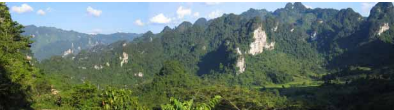
The limestone karst landscape of the proposed Francois' Langur Species and Habitat Conservation Area