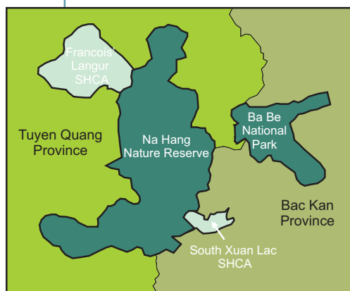
Map of the four protected areas in the Ba Be / Na Hang Conservation Complex, showing the new sites in light blue.

Through biodiversity surveys and hotspot analysis, PARC's landscape ecology approach led to proposing an expansion of the protected area network in the conservation complex. This recommendation was based on the need to provide greater protection for key species of conservation concern, to reduce forest fragmentation and to compensate for some of the habitat loss resulting from the dam. PARC Project worked with provincial and district Forest Protection Departments to establish two new protected areas contiguous with Na Hang Nature Reserve.