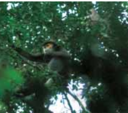
Black-shanked Douc Langur at Yok Don Mountain

Yok Don National Park was established in 1991 in Buon Don District, Dak Lak Province, in order to protect 58,200 hectares of lowland dipterocarp forest.