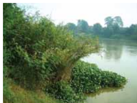
Water hyacinth and Mimosa pigra on the banks of the Srepok River were highlighted for urgent conservation management by PARC Project.