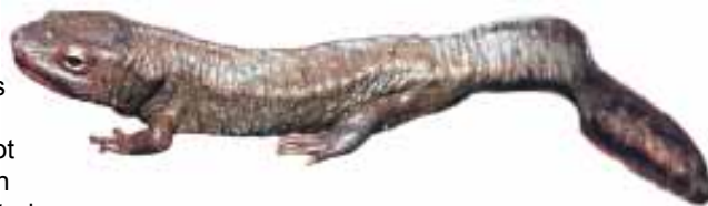
The endemic Vietnamese Salamander was found in habitats outside the established protected areas, highlighting the need for a broader landscape approach to biodiversity conservation at Ba Be and Na Hang.