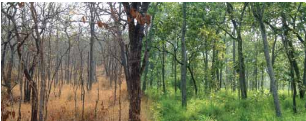
Same forest, different seasons: the contrasting difference between the deciduous dipterocarp forest in the dry and wet seasons

Although only one village is located within the park, the forests and wildlife of Yok Don National Park are under threat from hunting, grazing and bush fires. Furthermore, pressure is increasing with population migration and infrastructure development in the immediate vicinity of the national park.