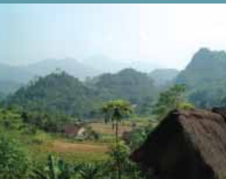
PARC Project sought to reconcile this mosaic of different land-uses outside Ba Be National Park with conservation objectives inside the national park.

Boundaries and land-use defined for current, newly-established and proposed protected areas.