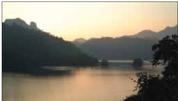
Ba Be Lake

There are 15 villages in the national park, with about 3000 residents of Tay, Dao and Mong ethnicity, many of whom depend upon the lake's fisheries.