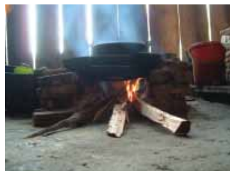
Simple improved stoves like this can reduced fuelwood use by 30%.