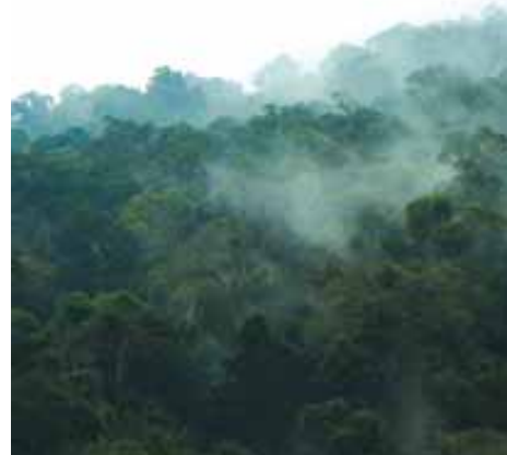
Forest on limestone mountains in Ba Be National Park.

The PARC operational planning model was designed to suit the current protected area planning framework in Viet Nam. In support of this approach, the Ministry of Agriculture and Rural Development approved PARC Project sites as pilot areas for operational planning in Viet Nam. Within the approved management strategy for the protected area system in Viet Nam, operational plans will be used as a guide for deciding funding allocations for protected areas. The Viet Nam Conservation Fund has also incorporated the formulation of operational plans as one of its conditions for funding approval.